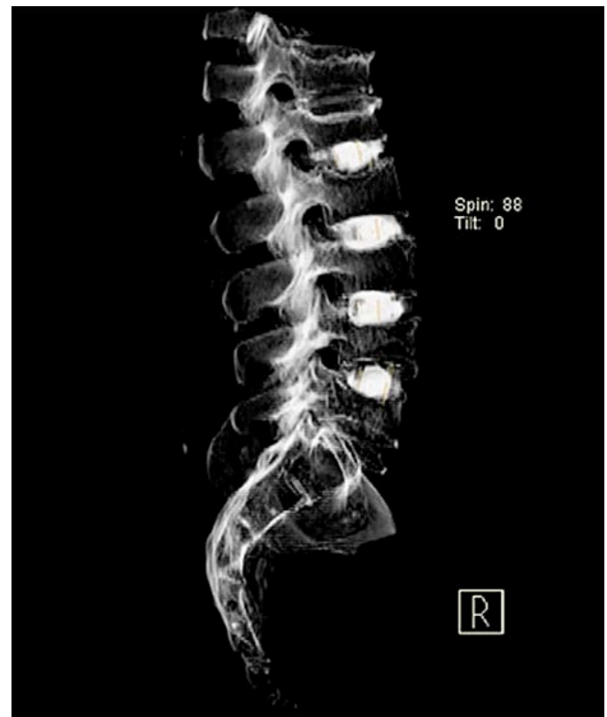
Figure 5: 3-D CT-scan image of post Infill injection of graft material.