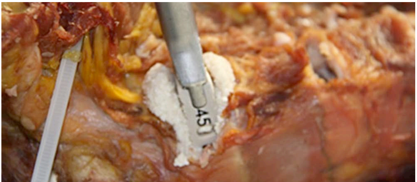
Figure 3: Picture of lateral cage and graft falling out during insertion.

Thin-cut CT-scans (6 mm) with 3-D reconstructions were performed to demonstrate the standard cage and graft implantation with particular attention to volumetric analysis and endplate surface contact. The InFill lateral system technology was then utilized at each level to inject additional graft material into the interbody spaces and cages. CT imaging was repeated to attain comparison data for pre and post fill changes. Table 1 demonstrates the findings of the CT-scan report.